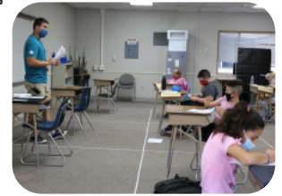
Photo taken during pandemic.

To continue our work for students' learning development, YMCA of San Diego County is a dedicated member of the California Afterschool Advocacy Alliance (CA3) , a program dedicated for youth and their families who rely on publicly funded expanded learning programs throughout California.